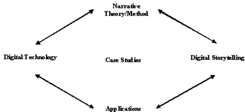
Figure 1. The Digital Narrative Interface.

This paper deals with theoretical and methodological reflections arising from a number of pilot projects carried out over the last six years within the Narrativeworks project and presents a model that illustrates the development of a digital/narrative approach to teaching, research and service development in a U.K. university faculty largely concerned with professional training in the field of education, health and social care. Examples of these projects can be viewed at: http://www.narrativeworks.com/ . The pilot projects grew out of the experience of developing and teaching two modules that explored issues of culture, community and identity through the use of Biographical Narrative Research ( http://www.talkinglongterm.co.uk/courses.php ). One recurring theme in discussion of projects generated within these modules was the way in which the narrator's voice, itself a defining part of an individual's identity, was being systematically stripped away by the contemporary conventions of a transcript based approach to data analysis and presentation. Answering the question of what could be done about this opened up a complex "theory saturated space" (TSS) represented in the diagram below.